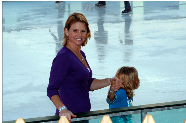
Auto Levels Applied – Normal Blending Mode

Sometimes using the Levels command or sharpening an image can cause colors to shift slightly. To avoid this change the layer Blending Mode to Luminosity from its default Normal. Below is an example using Auto Levels on an Adjustment Layer. This works in both PSE and Photoshop.