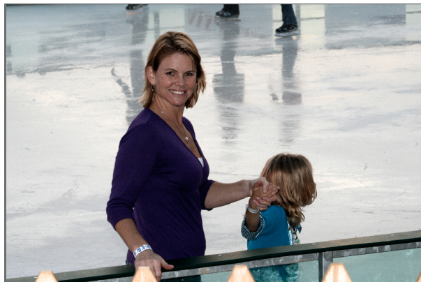
Auto Levels – Luminosity Blending Mode